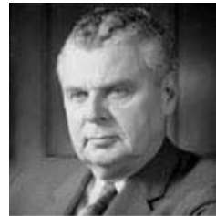
J.G.B. [John George Bannerman] Diefenbaker (1957-1963)