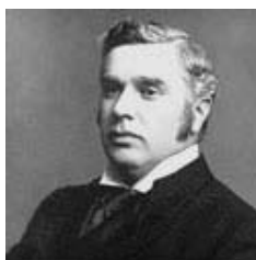
Jno S.D. [John Sparrow David] Thompson (1892-1894)