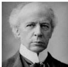
Wilfrid Laurier (1896-1911)