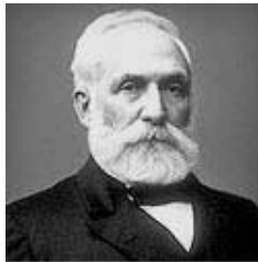
Mackenzie Bowell (1894-1896)