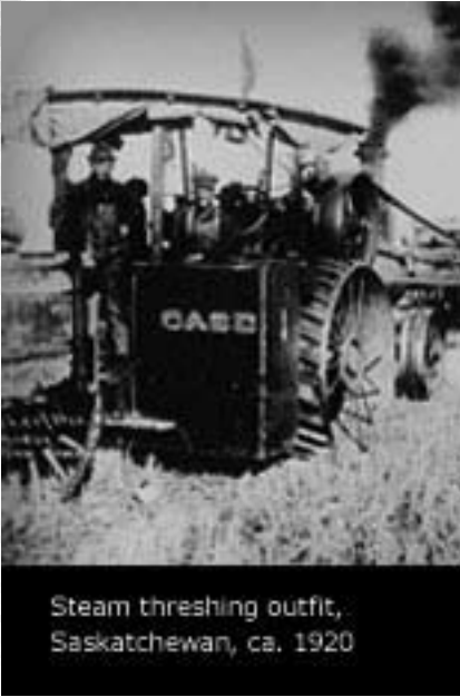
Steam threshing outfit, Saskatchewan, ca. 1920