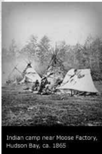
Indian camp near Moose Factory, Hudson Bay, ca. 1865