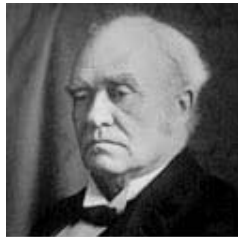
J.J. [John Joseph] Abbott (1891-1892)