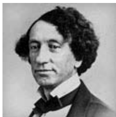
John A. Macdonald (1867-1873, 1878-1891)