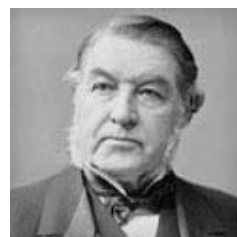
Charles Tupper (1896)