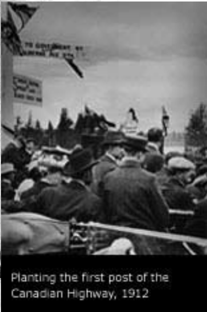
Planting the first post of the Canadian Highway, 1912

Due to the high volume of applications we receive each year, only candidates selected for an interview will be notified.